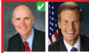
Rick Scott Bill Nelson