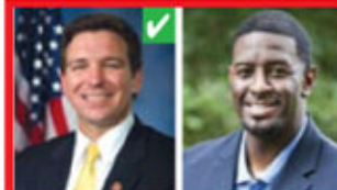
Ron DeSantis Andrew Gillum